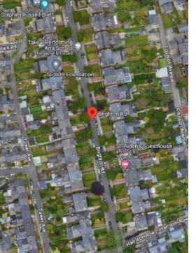
"Our submission with some of our objections"

It is also noted that many protected structures are in Terenure Road East an Brighton Road, but NTA want to demolish historic boundary walls an gardens of RPS. As there is parking on both sides of Brighton Road, it wou be safer if the parking was kept on one side for the road to have its two-waystem that residents have been in touch about. As there are no drivewar on the houses, are the residents approved to revise their system for driveway, such as the RPS in Palmerston Road, etc.? I include the list RPS and the view of no driveways.